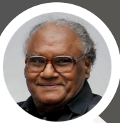
Bharat Ratna Prof. C.N.R. Rao JNCASR, Bengaluru Chairperson

Date: Friday, 29th May 2020 Time: 11.00 AM - 12.40 PM