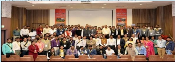
IIRS Outreach programme feedback session during IIRS Academia Meet (IAM)-2020

The participants can submit their feedback through online portal. Feedbacks are critically analyzed and implemented in next courses. For one to one feedback the participants and participating organizations are invited to attend annual IIRS User Interactive Meet (IUIM) at IIRS Dehradun.